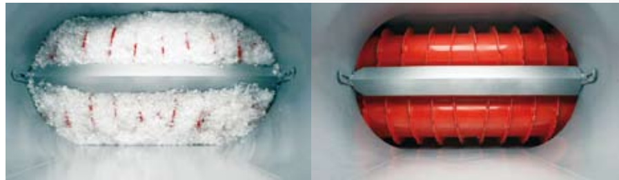
View of the top conveying unit, with and without fibres

On request, specific tests and analyses can be conducted on the m-tec pilot plant, for field-tested dosing values and the ideal adjustments to the most diverse conditions