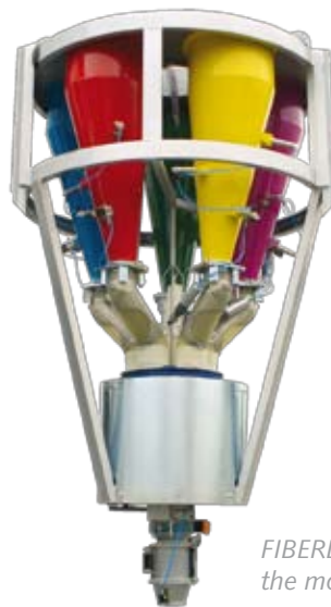
FIBERDOS® is designed for dosing the most diverse fibres.

Precision is not dependent on the bulk material