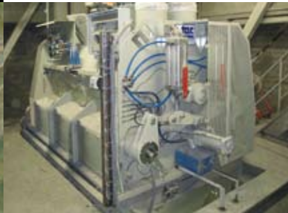
... after. Fit again. Retrofit.